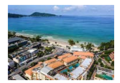
PATONG PARAGON RESORT & SPA

PATONG PARAGON RESORT & SPA 135 M.4, Suksawad Rd., Soi 68, Phrapadeang , Samutprakarn 10130 WhatsApp +66 89668 1279 Mobile: 089-668-1279 E-Mail : dos@patongparagon.com, Website : www.patongparagon.com